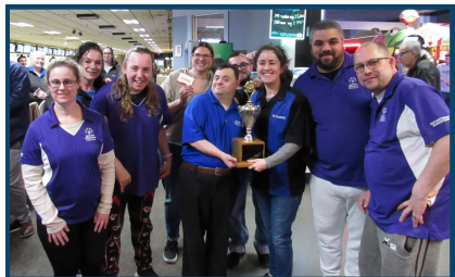
The 2024 winning team, Coastal Credit Union, and Special Olympics Rhode Island athletes.