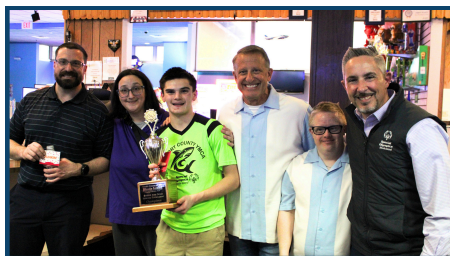
The 2025 winning team, Navigant Credit Union, and Special Olympics Rhode Island athletes.